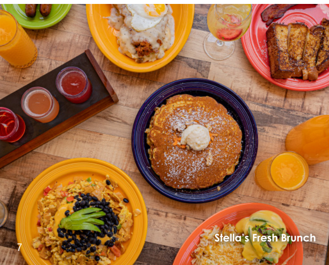
Stella's Fresh Brunch

Roll out of your cozy hotel bed and right into one of Pearland's brunch-tastic local restaurants. Whether you're in the mood for mimosas and avocado toast, chicken and waffles, or a build-your-own michelada bar, you can truly have it all.