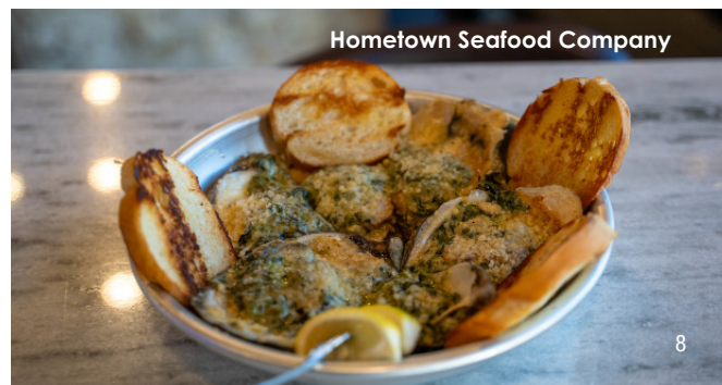
Hometown Seafood Company

Discover all that Pearland has to offer and peruse our master list of restaurants when planning your next gastro vacation.