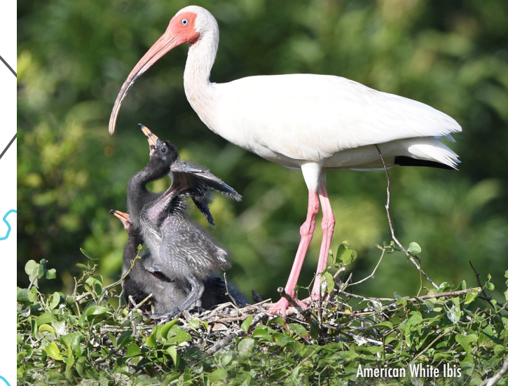
American White Ibis