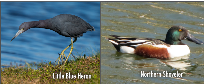
Little Blue Heron