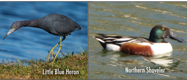
Little Blue Heron